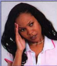
HEADACHE & NECK PAIN

TESTING AVAILABLE: XRAYS / NCV / EMG / SNT / MUSCULOSKELETAL ULTRASOUND COMPUTERIZED TESTING: ROM / MUSCLE STRENGTH / GRIP / PINCH